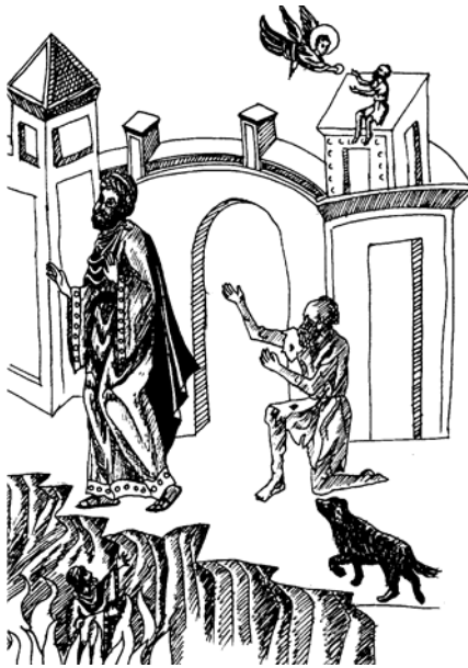
The Rich Man and Lazarus