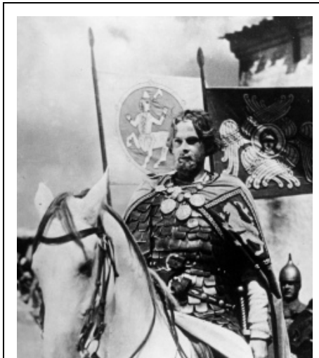
St. Alexander from the 1938 film.

tersburg from the city of Vladimir. Tsar Peter commissioned an enormous, ornate, silver reliquary to hold the saint's relics, and had them placed in the monastery's Holy Trinity Cathedral. This (empty) reliquary is on display in the Hermitage Museum, and today a more modest reliquary holds the saint's relics. It is located in the cathedral, up front, on the right, readily accessible for veneration. Since the 1917 revolution, the buildings of the St. Alexander Lavra Monastery were used primarily by the government, except for the Trinity Cathedral that was one of the few "working" churches in St. Petersburg. Functioning also since the end of World War II is the Theological Seminary and Academy, which is adjacent to the monastery. At long last, in the Spring of 1996 the Lavra itself was given back to the Church by the State, and reopened as a monastery.