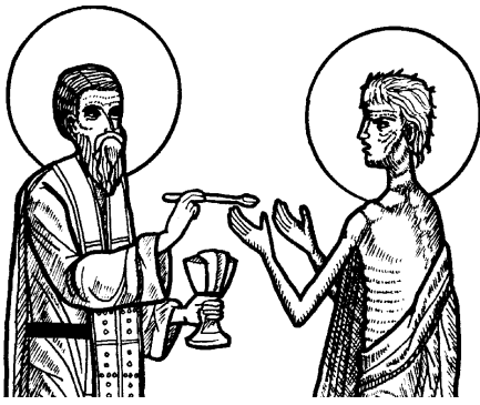
ST. ZOSIMA AND ST. MARY OF EGYPT