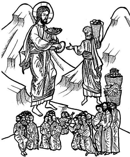
Christ Feeds the Multitudes